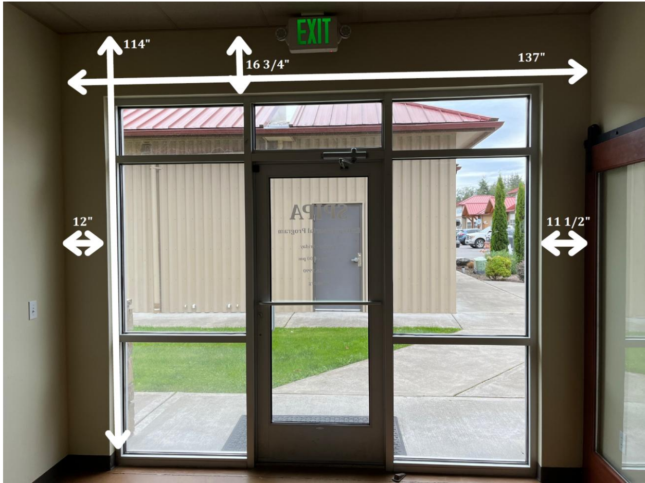
EPC Rear Facing Wall