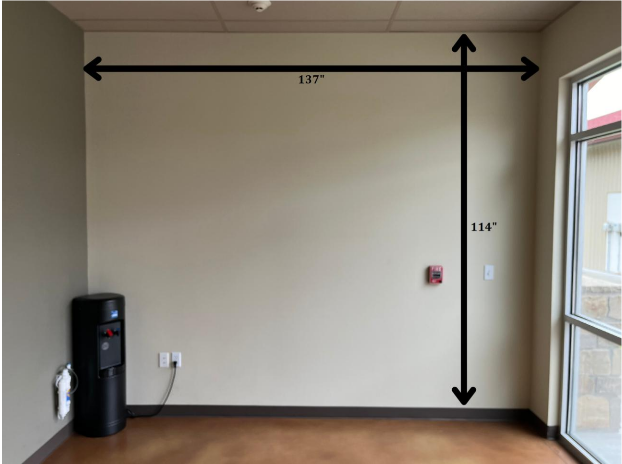
EPC Right Wall